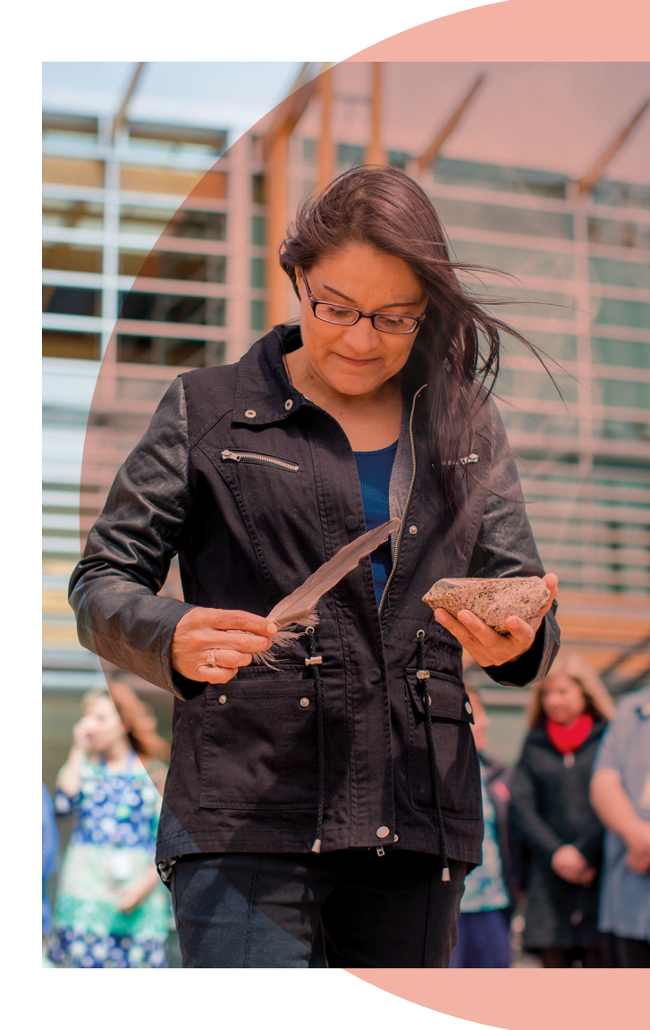
PICTURED: Smudging ceremony for staff and attendees during a National Indigenous Peoples Day celebration at Thunder Bay Regional Health Sciences Centre.

We are also committed to building the capacity of our own team, enriching their knowledge and awareness, while encouraging thoughtful engagement in Indigenous health matters. For our members, we will leverage our core services to foster collaboration and learning among hospitals as they pursue their own journeys in Indigenous Health.