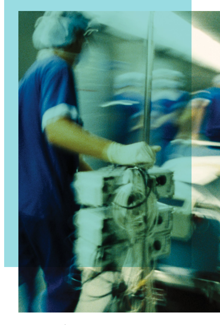
PICTURED: Image from OHA's Here to Care campaign created to remind Ontarians that against adversity and beyond challenges, Ontario's hospitals have and will continue to be there for their communities.

hospitals and across the entire health system, which includes calling on the province to develop a funded, multi-stakeholder and evidence-based strategy. On this and other issues, the OHA will represent the strong collective voice of Ontario's hospitals, encouraging action that is in the best interest of patients, caregivers, and the broader health system.